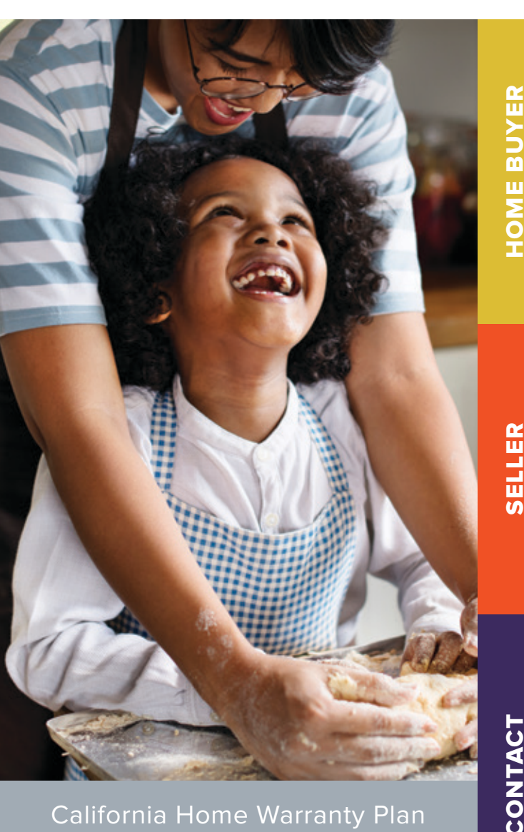
California Home Warranty Plan homewarranty.com 1-800-TO-COVER

Fidelity National Home Warranty helps manage and protect your home expenses with protection plans that cover major systems and appliances. Whether you are a home buyer or home seller, a home warranty is a very affordable way to protect your most valuable asset! It is the type of investment that pays for itself. There is simply no substitute.